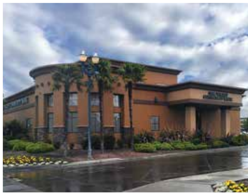
4120 Dale Road