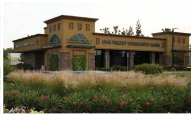
3508 McHenry Avenue

We're committed to serving the banking needs of Central Valley businesses and the local people and families who breathe life into them.