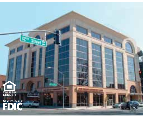
1200 I Street