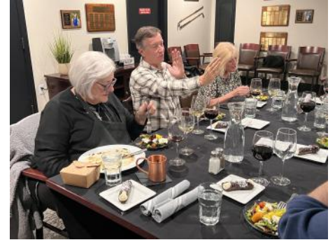
Casino Night to Celebrate Fox Hill's official 50th Anniversary-