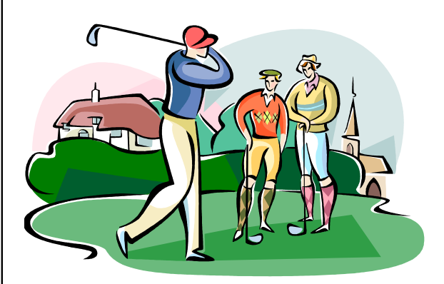
Friendly Golfers Play Here

PRESORTED STANDARD U.S. POSTAGE PAID PERMIT NO. 58 EL PASO, IL.